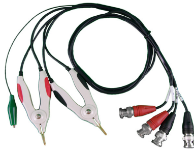
Kelvin Test Leads