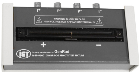
Remote Test Fixture