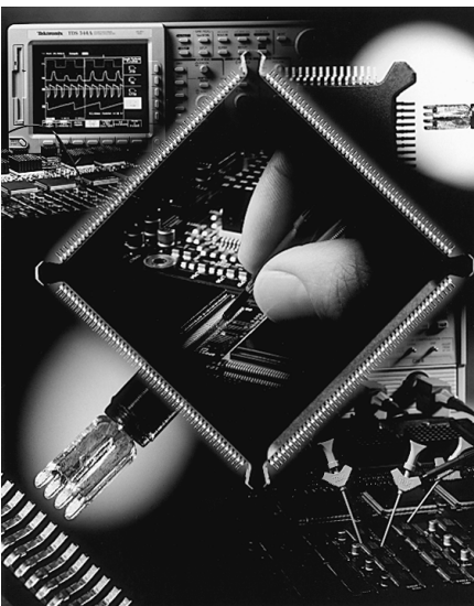
► SF500 Series (Surefoot)