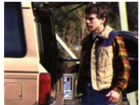
The Phase Matrix 25B/28B feature a convenient built-in carrying handle and protective front cover.