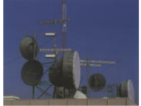
The 25B and 28B are ideal for frequency and power level testing of terrestrial microwave systems.

With a single connection, the 25B and 28B can simultaneously measure and display the input signals frequency and power level in the microwave band, eliminating the need for a separate microwave power meter. Within the 25MHz bandwidth of the YIG-preselector, only the selected signals frequency and power level are measured. Signals to be analyzed are selected by keystroke entry of an individual center frequency, or search a range between a low and high frequency limit. This signal selectivity, combined with 20MHz of FM tolerance at all rates up to 10MHz, allows the 25B and the 28B to make accurate frequency and power level measurements even while the input signal is carrying traffic; there is no need to take the transmitter, or adjacent channels, off the air for routine checks.