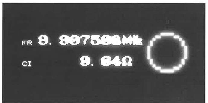
▲ GO/NO-GO testing of a crystal oscillator

After a device is measured, display can only be made from the test results which satisfy the goals. GO/NO-GO decisions against preset limit values can be displayed quickly and in an easy-to-read format.