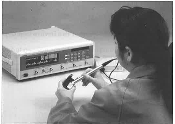
▲ Bar code input

When testing electronic components or other devices, the set measurement conditions must be changed every time the device to be tested is changed. By connecting a bar code reader human input errors can be eliminated and settings can be changed easily.