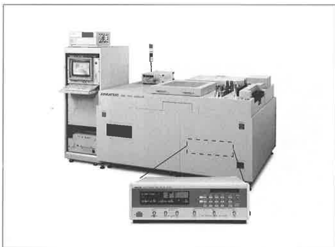
▲ Construction of an automatic measurement system by use together with a test handler

When used with automated equipment, normal data processing is done by a personal computer and the R3752H Series displays only the minimal data necessary for cost and space reductions.